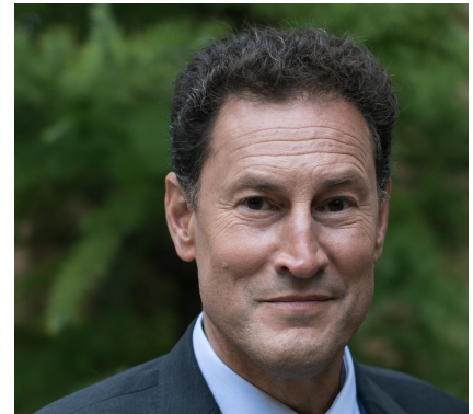
Steve Paikin , host of The Agenda

In addition to the primary benefit package detailed on page 6, your sponsorship includes the following: