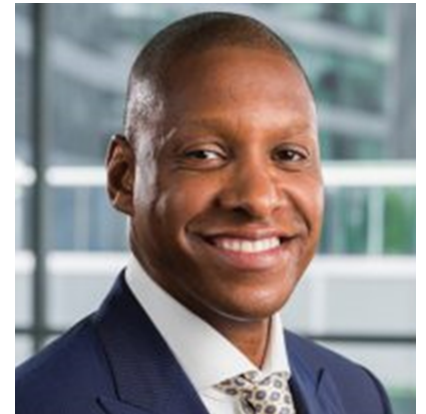
Masai Ujiri President and Vice-Chairman, Toronto Raptors, Founder, Giants of Africa