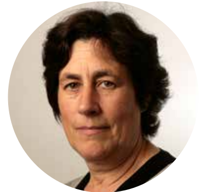
Chantal Hébert National affairs columnist at the Toronto Star