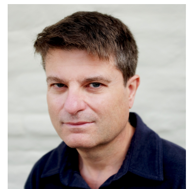
Martin Ford Futurist, author

1 To be included in materials, all graphic materials must be submitted by November 12, 2021 .